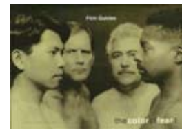
The Color of Fear Film Guide CD/DVD Set