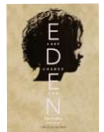
Last Chance for Eden Film Guide CD/DVD Set